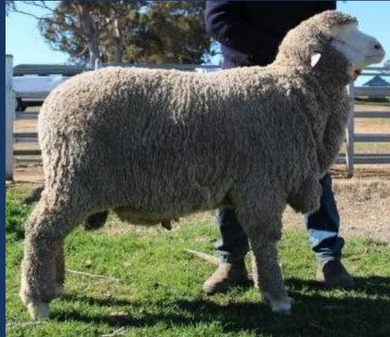
Tag- 289 Sire-RP1135 Mic-18.4 SD-2.7 CV-14.7 Tag-522 Sire-PB338 Mic-18.6 SD-2.8 CV- 15.1