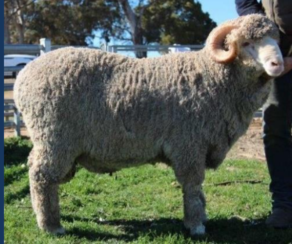
Tag-1059 Sire-Y961 Mic-17.8 SD-2.5 CV-14.2 Tag-868 Sire- OneOak10 Mic-19.5 SD-3.0 CV-15.4