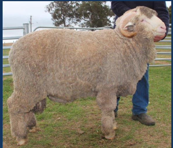
Tag-1162 Sire-2222syn Mic-18.6 SD-3.3 CV-18